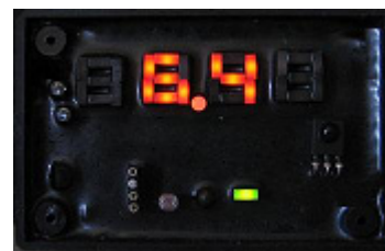
Red Action Required