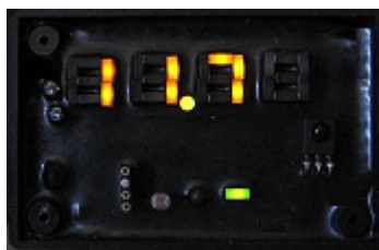
Yellow Out of Tolerance